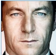
25 Overlooked Gems On Netflix You Should Be Watching