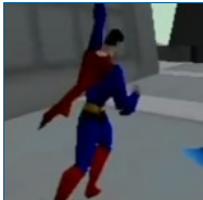
7 Completely Broken Games That You Still Bought Anyway