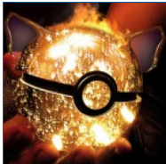
Rumored Details About The Next 'Pokemon' Game