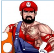
8 Things About Mario You Probably Didn't Know

FILED UNDER: 3D CGI , INDUSTRY , MOVIES , NEWS , TOONS TAGGED WITH: DISNEY , LAWSUIT , LOTS-O-HUGGIN BEAR , PIXAR , TOY STORY 3